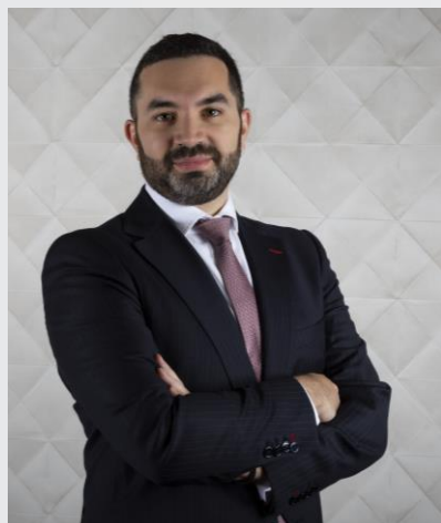
Partner, Energy, Resources and Industrials Sector Leader Deloitte