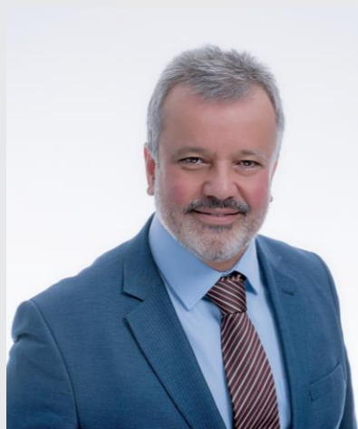
Managing Director Hellas & Cyprus Hewlett Packard Enterprise

HELLENIC ASSOCIATION for ENERGY ECONOMICS