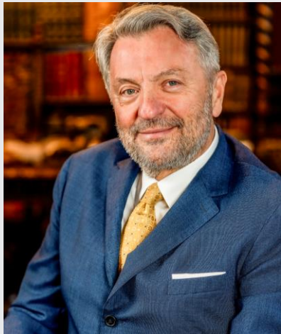
CEO RCI Holding

HELLENIC ASSOCIATION for ENERGY ECONOMICS