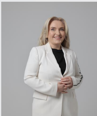
CEO & Founder Cedera Group, Romania & Moldova

HELLENIC ASSOCIATION for ENERGY ECONOMICS