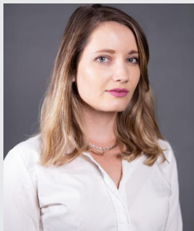
Deputy Director, European Energy Security Atlantic Council

HELLENIC ASSOCIATION for ENERGY ECONOMICS