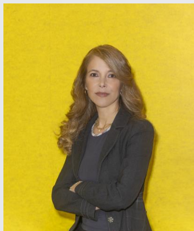
General Manager Microsoft, Greece, Cyprus & Malta