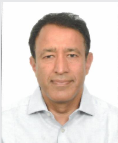
CEO, RP Group Director of International Business, Greenko

He is the CEO of RP Group for 14 years and Director of International Business of Greenko. RP Group is the largest EPC company in energy sector for Middle East. It employs 92,000 people in different streams of engineering. RP Group has turn over of 18 billion dollars. Greenko is Asia's largest green energy company and transition platform. The Group is setting up 2 million ton green ammonia plant, which will be commissioned in 2026. Greenko already established 14 GW of renewables with an investment of 16 billion dollars. Currently running 6 GW of Pump storage and 18 GW pump storage under construction. Greenko is invested by GIC Singapore, and Abu Dhabi investment authority. Prior to this he worked in World Bank for 6 years. He studied civil engineering at Imperial College London imperial college and holds and MBA from London Business School.