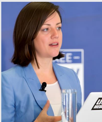
Director of Climate Change and Sustainability Centre Bank of Greece

HELLENIC ASSOCIATION for ENERGY ECONOMICS