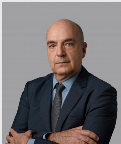
Vice President & Managing Director Gastrade

HELLENIC ASSOCIATION for ENERGY ECONOMICS