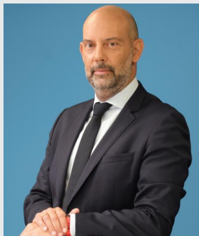
Director, Group Decarbonization Strategy Titan

HELLENIC ASSOCIATION for ENERGY ECONOMICS