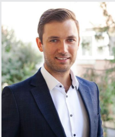
Chief of Staff Ministry of Energy, Moldova

HELLENIC ASSOCIATION for ENERGY ECONOMICS