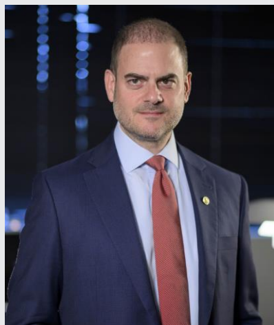
President American-Hellenic Chamber of Commerce

HELLENIC ASSOCIATION for ENERGY ECONOMICS