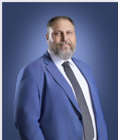
General Director Eunice Energy Group