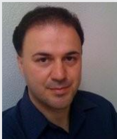
Founder and CEO DeepRunner.ai

HELLENIC ASSOCIATION for ENERGY ECONOMICS