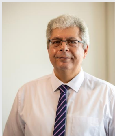
Managing Director Digital Realty

HELLENIC ASSOCIATION for ENERGY ECONOMICS