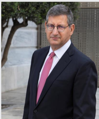
CEO National Bank of Greece