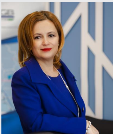
Executive Officer and Board Member ICGB AD