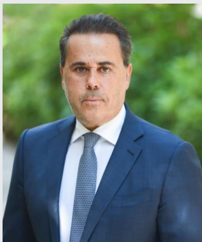
Minister Ministry of Environment & Energy, Greece

HELLENIC ASSOCIATION for ENERGY ECONOMICS