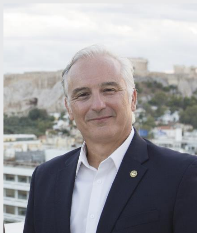
Executive Director American-Hellenic Chamber of Commerce