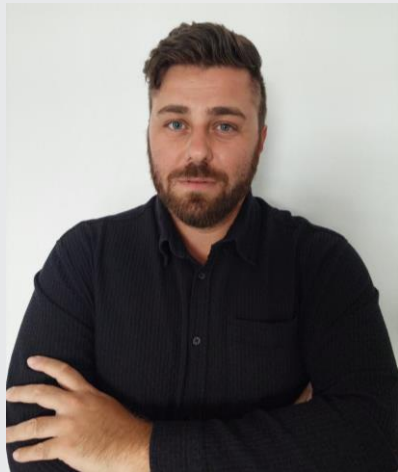
Journalist Makedonika Nea