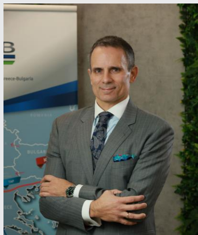
Executive Officer and Board Member ICGB AD