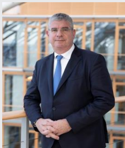
Vice President European Investment Bank (EIB)