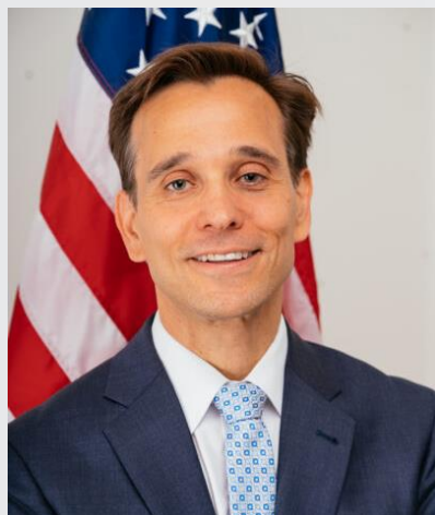
Chargé d' Affaires U.S. Embassy, Greece

HELLENIC ASSOCIATION for ENERGY ECONOMICS