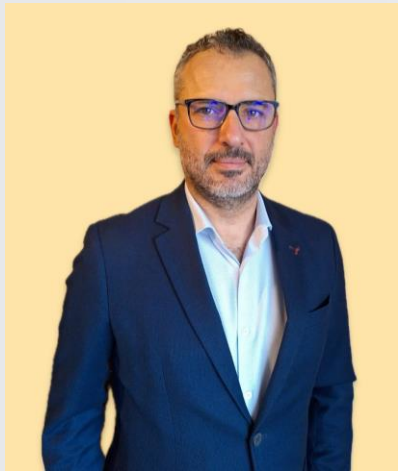
Regional Managing Director, MEA & Greece, M Renewables Metlen

HELLENIC ASSOCIATION for ENERGY ECONOMICS