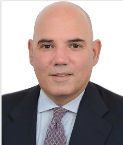
Sr. Engineer II, Global Ship Systems Centre American Bureau of Shipping (ABS)