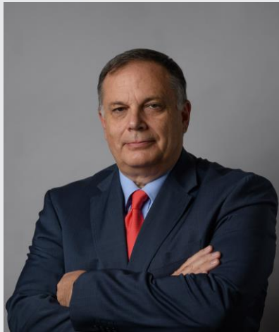
CEO, Renewables and Battery Storage Business Unit Copelouzos Group