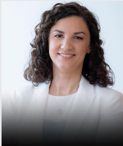
Minister Ministry of Economy, Kosovo

HELLENIC ASSOCIATION for ENERGY ECONOMICS