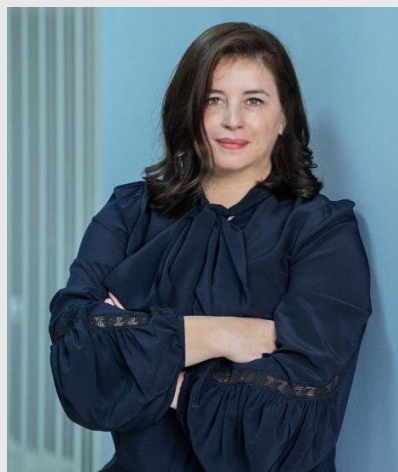
Managing Director Eco Hellas