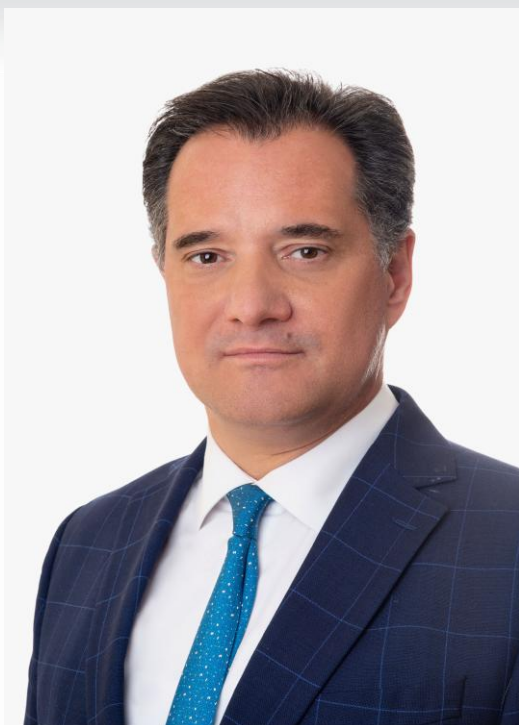
Adonis Georgiadis Minister Ministry of Health