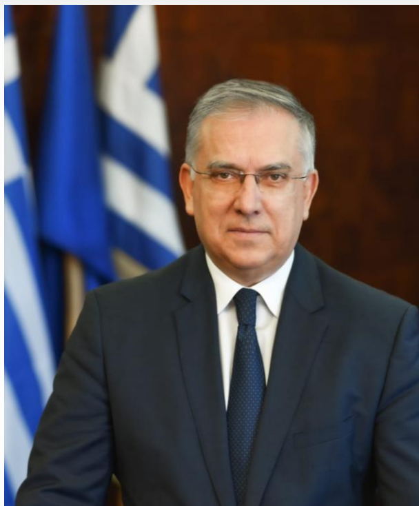
Panagiotis (Takis) Theodorikakos Minister Ministry of Development

Panagiotis (Takis) Dimitriou Theodorikakos is Minister of Development and Member of Hellenic Parliament of Athens B3 Constituency (South).