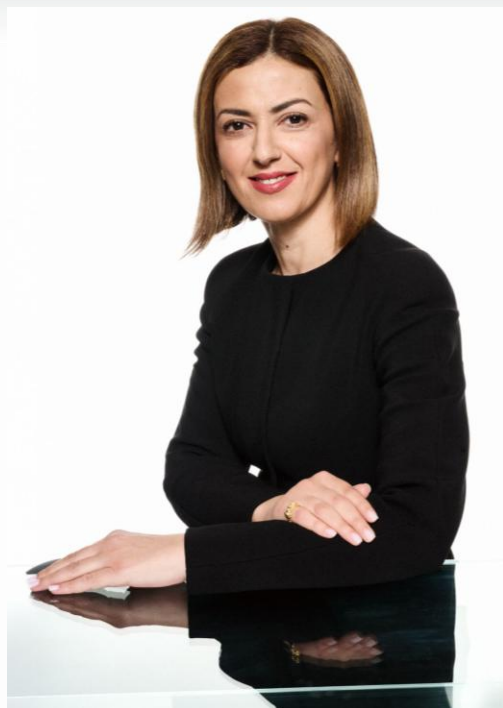
Eirini Agapidaki Alternate Minister Ministry of Health

Eirini Agapidaki is a Psychologist, with an MSc in Health Promotion and Education from the Medical School of the National and Kapodistrian University of Athens; and a PhD in Health Psychology from the same university. She has also specialized in matters of prevention of mental disorders and promotion of mental health. In addition, she has many years of teaching and research experience in the fields of public health policy, public health research methodology and mental health promotion – in the context of national, European and international research programs. She has worked for many years as a research associate at the Department of Hygiene, Epidemiology and Medical Statistics, of the Medical School of the National and Kapodistrian University of Athens. In recent years she was elected and served as a Lecturer in Public Health, at the Medical School of the European University of Cyprus. In 2019, she resigned from her academic role in order to take up her duties as the Special Secretary for the Protection of Unaccompanied Minors (at the Ministry of Migration and Asylum). At the end of December 2022, she assumed the duties of Secretary General of Public Health, and since July 2023 she serves as the Alternate Minister of Health and as a member of the Greek Parliament.