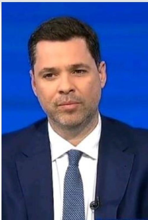
Thanasis Kontogeorgis Deputy Minister to the Prime Minister Hellenic Republic

Thanasis Kontogeorgis is the Deputy Minister to the Prime Minister, since June 2023. His main areas of responsibility cover the monitoring and coordination of the government's work with emphasis on the reform program, the implementation of the National Resilience and Recovery Plan "Greece 2.0", the local and regional development strategies, etc. He is responsible for the design and preparation of the Consolidated Government Plan with the contribution of the General Secretariat for the Coordination and leads the Special Secretariat of Foresight.