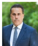
STAVROS PAPASTAVROU Minister Ministry of Environment & Energy, Greece