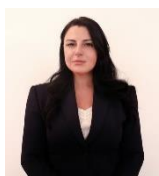
BELINDA BALLUKU Vice Prime Minister Minister of Infrastructure & Energy, Albania