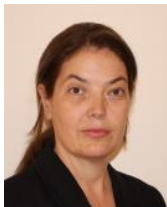
IVA PETROVA Deputy Minister Ministry of Energy, Bulgaria