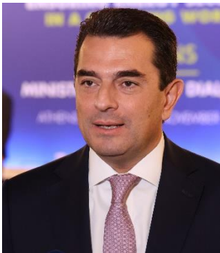
Konstantinos Skrekas Minister Ministry of Development

Konstantinos Skrekas comes from Megarhi, Administrative District of Trikala, he is married and the father of two children. He holds a Degree in Civil Engineering from the Aristotle University of Thessaloniki, Greece (Civil Engineering Department, Faculty of Technology), and an M.Sc. in Construction Management from the University of Birmingham, UK. After completing his studies, he worked in the Fast-Moving Consumer Goods sector in managerial positions. He is the co-founder of a company operating in the FMCG sector and held the position of CEO for 15 years.