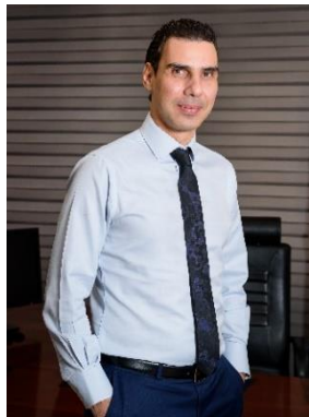
Marios Themistocleous Deputy Minister Ministry of Health

SEIU Hellenic Association of Self-Employed