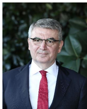
Panos Tsakoglou Deputy Minister Ministry of Labor and Social Affairs

BA in Economics (University of Thessaloniki), MA and PhD in Economics (University of Warwick). Professor, Athens University of Economics and Business, Research Fellow of the Institute for the Study of Labor (IZA, Bonn) and Senior Research Fellow of the Hellenic Observatory (LSE, London). He has published over 100 books, scholarly articles and contributions to collective volumes, made over 200 presentations in conferences and workshops and participated in over 50 research and consultancy projects. His research focuses on Economics of Social Policy (inequality, poverty, social exclusion, redistributive role of the state) Labour and Education Economics (determinants of unemployment, returns to education).