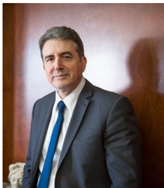
Michalis Chrysochoidis Minister Ministry of Health

Michalis Chrysochoidis has a rich and diverse experience in security policy, energy, infrastructure, markets and trade. He was elected and has served for several years as Member of the Greek Parliament. He has served as Minister for Citizen Protection, for Infrastructures, Transports and Networks, for Growth, Competitiveness and Shipping and as Deputy Minister for Growth and Trade.