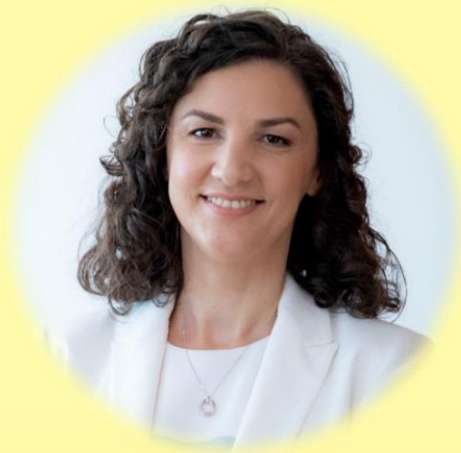
Artane Rizvanolli Minister of Economy Kosovo

Dr. Artane Rizvanolli is a lecturer at Riinvest College since 2007. Upon obtaining her Bachelor's degree in Economics in 2006, she continued her Master studies in Economics for business analyses in Staffordshire University in the UK. In 2012, she completed her PhD in Economics from Staffordshire University focusing on the relationship between human capital and foreign direct investment in European transition economies. After her six-year engagement as a researcher at Riinvest Institute, she continued her work as a researcher and consultant on economic analyses and policy-making with various local and international organisations in areas such as employment, private sector development, diaspora's effects on the economy, public finances, etc.