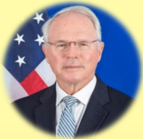
Christopher R. Hill Ambassador U.S. Embassy to Serbia