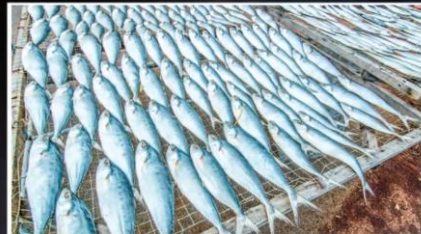
SUSTAINABLE seafood production