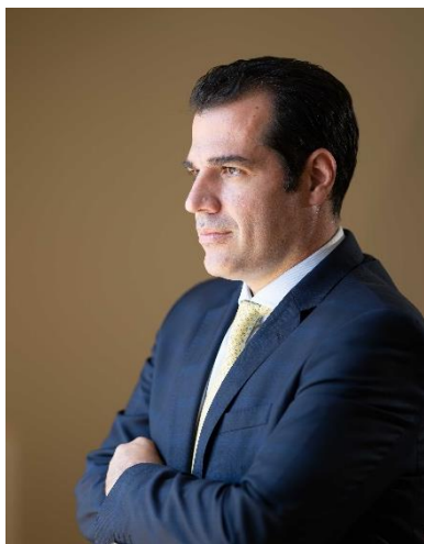
Thanos Plevris Minister Ministry of Health