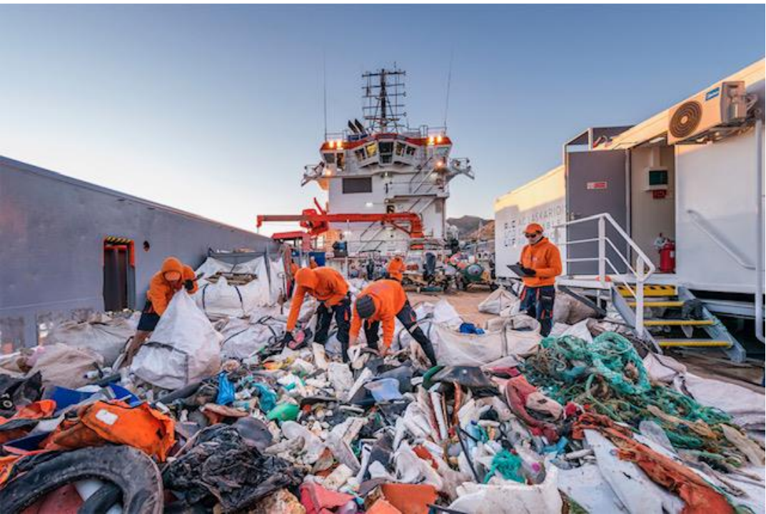
10 commonest types of beach litter