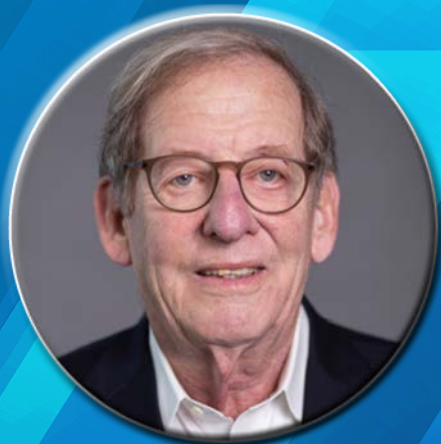
Richard L. Morningstar Founding Chairman, Global Energy Center Atlantic Council