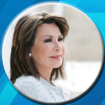
Gianna Angelopoulos-Daskalaki President "Greece 2021" Committee