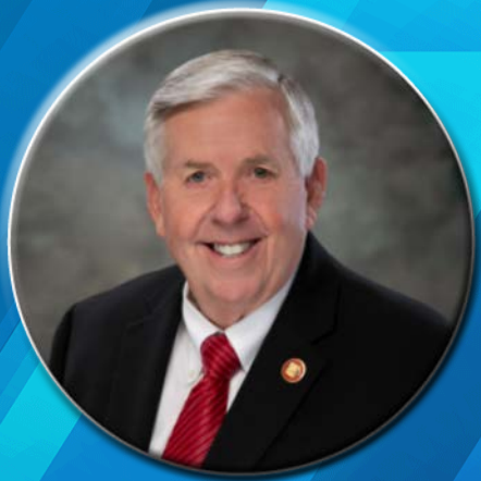
Michael L. Parson