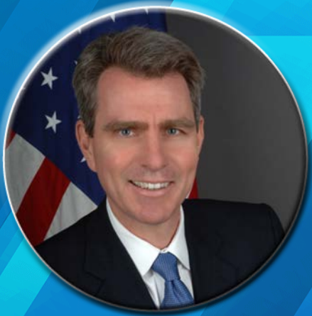
Geoffrey R. Pyatt

U.S. Ambassador to the Hellenic Republic