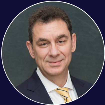
Albert Bourla Chairman and CEO Pfizer