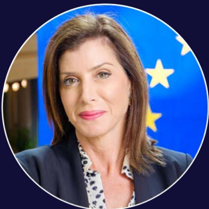
Anna Michelle Asimakopoulou

Member, Vice Chair Committee on International Trade European Parliament