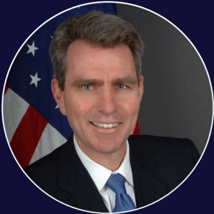
Geoffrey R. Pyatt

U.S. Ambassador to the Hellenic Republic