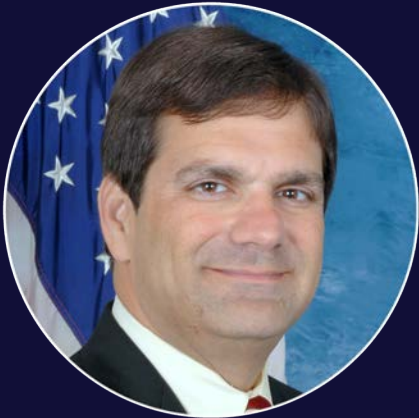
Gus M. Bilirakis

Congressman U.S. House of Representatives U.S.A.