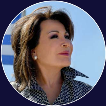
Gianna Angelopoulos- Daskalaki