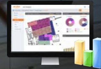
Location analytics Analytics and Location Engine (ALE) with northbound REST APIs