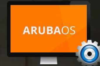
Network controls AOS8 with REST APIs to share context and program infrastructure