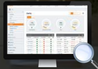
Network management AirWave with northbound XML APIs for data consumption