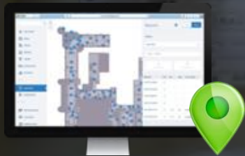
Micro-location services Meridian with mobile app development SDK and REST APIs