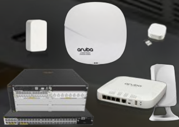
Aruba infrastructure: Wi-Fi, BLE, Wired, WAN