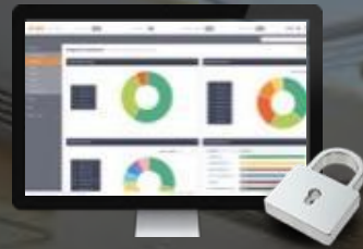
Policy management ClearPass with a unified API library and Extensions repository